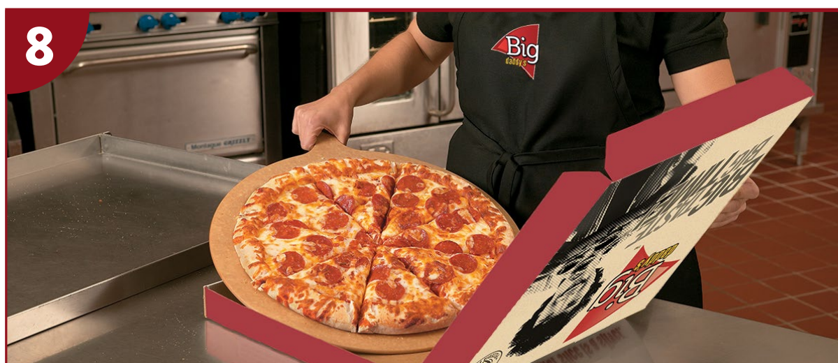
8 Place sliced pies into Big Daddy's™ boxes or your own serving trays.