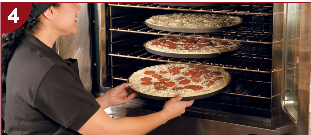
4 Place pizzas into preheated convection oven and center on oven racks. Bake pizzas until the center of the pizza reaches a temperature of 185 – 200°F.