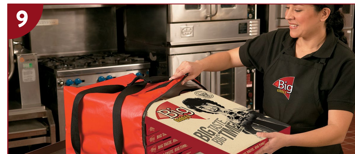
9 Place pizza boxes into insulated Big Daddy's™ delivery bags or place into warming cabinets until ready to serve.