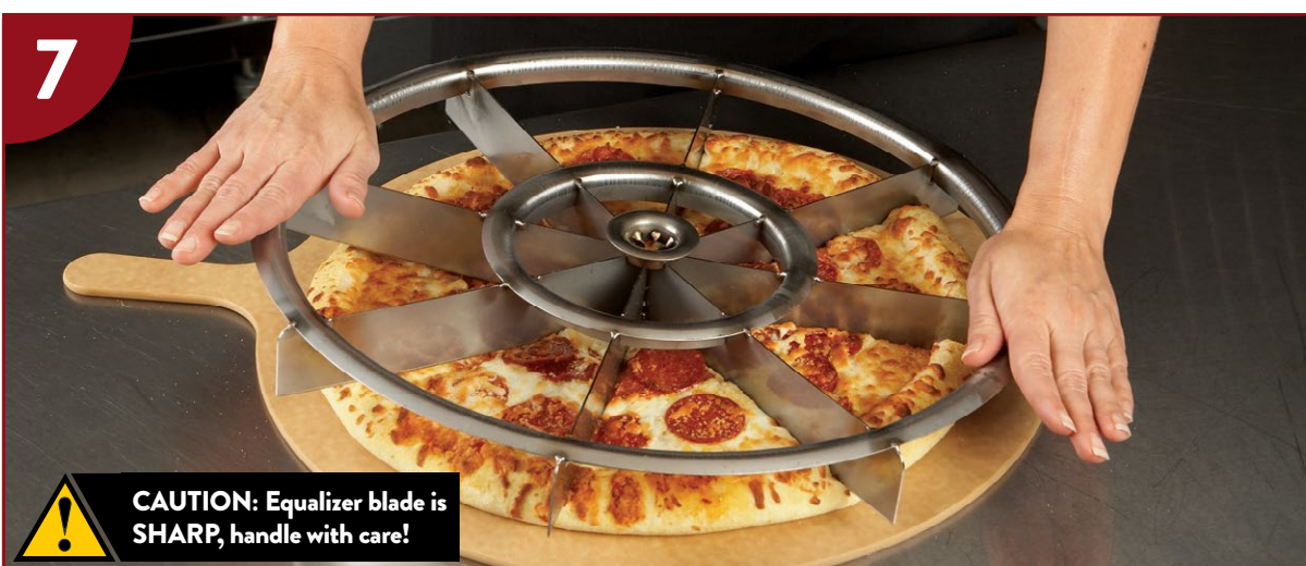
7 Slice pizza into 8–10 equal portions using an equalizer knife or pizza cutter.