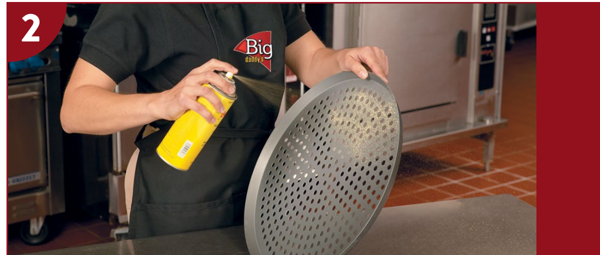
2 For pans without a nonstick coating, non-stick spray or parchment paper may be used.