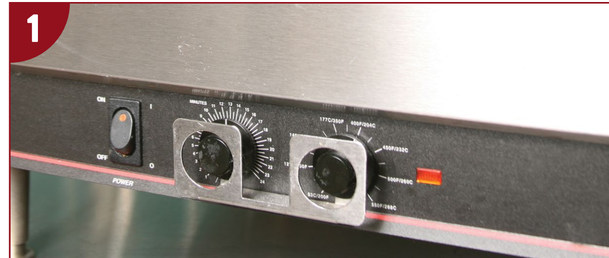
1 Set corresponding conveyor oven temperature and belt speed.