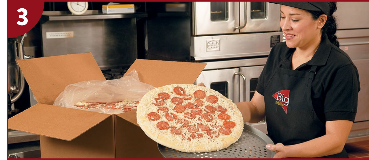
3 Remove Big Daddy's™ pizzas from the case. Center one per baking pan.