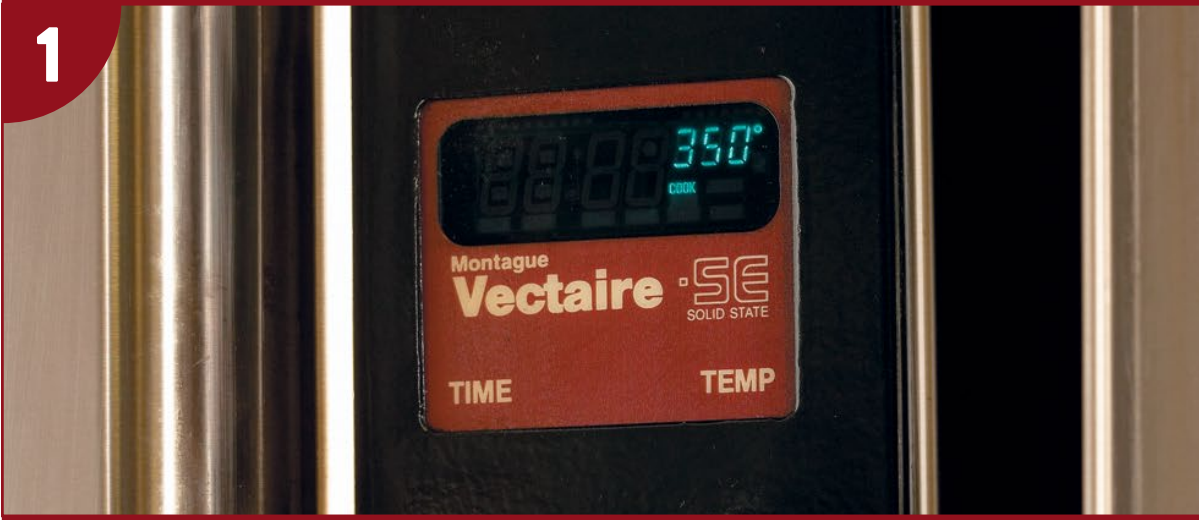
1 Preheat convection oven to 350°F. Suggested low fan speed if available.