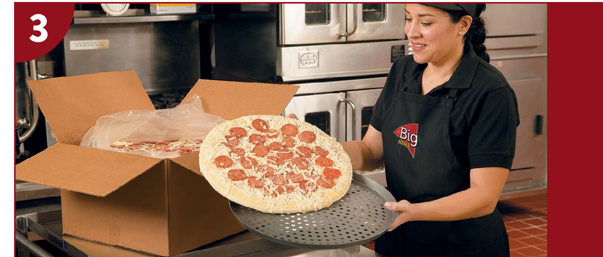
3 Remove Big Daddy's™ pizzas from the case. Center one per baking pan.