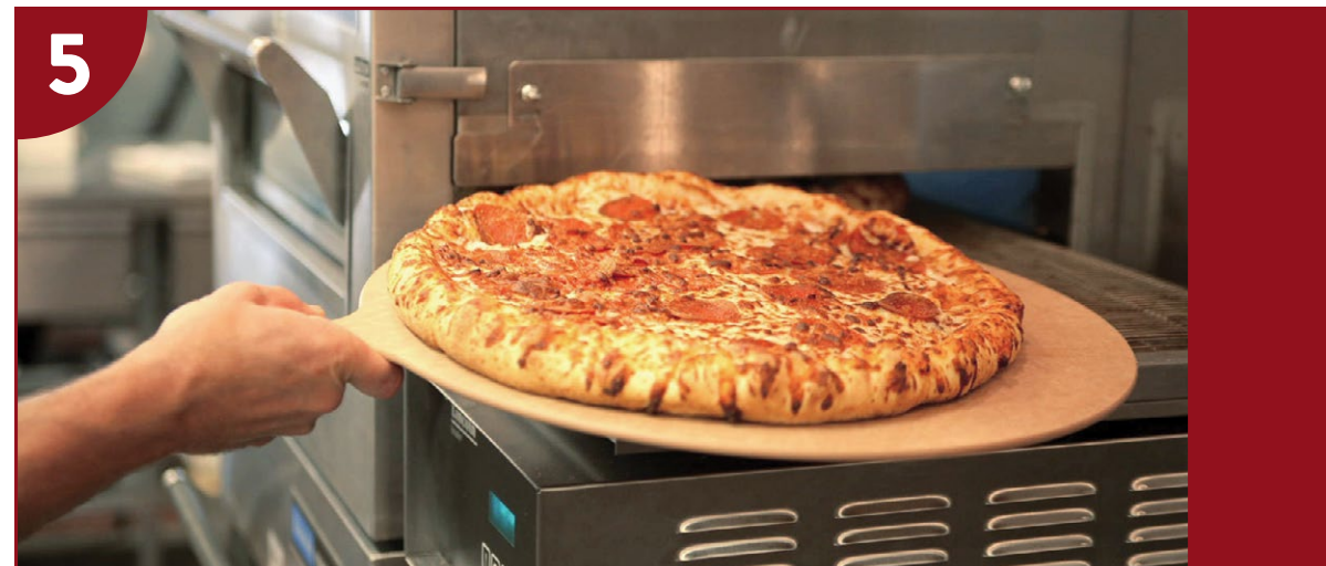
5 Remove pizzas from conveyor belt and place on cutting board.