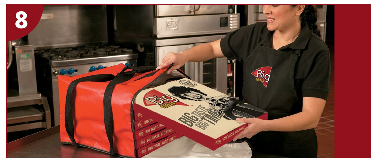
8 Place pizza boxes into insulated Big Daddy's™ delivery bags or in warming cabinet until ready to serve.