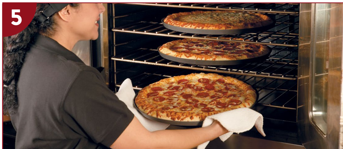
5 Check pizzas halfway through baking and rotate pans as needed.