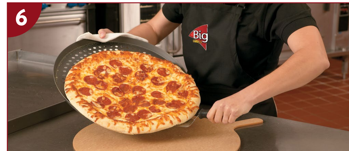
6 Remove pizzas from oven. Place pizzas on cutting boards or clean, dry prep surface.