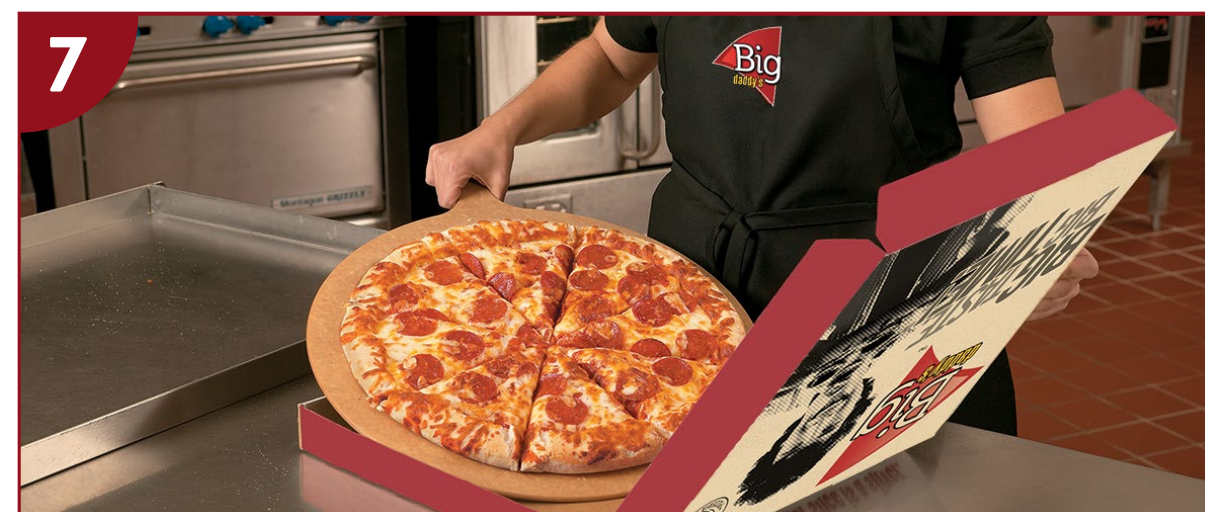
7 If using Big Daddy's™ pizza boxes, place pizza in boxes.