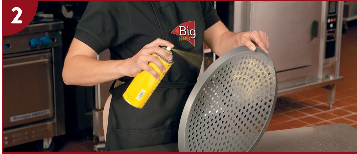
2 For pans without a nonstick coating, non-stick spray or parchment paper may be used.