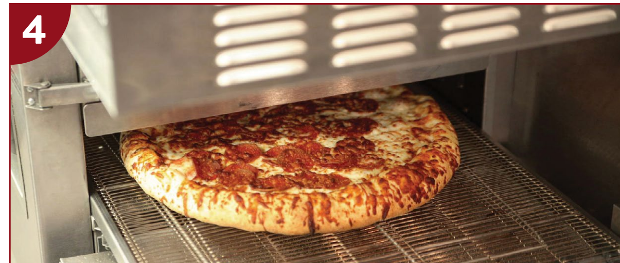
4 Place frozen pizzas on conveyor belt. Make sure pizza travels the entire length of belt. Bake pizza to internal temperature of 185–200°F.