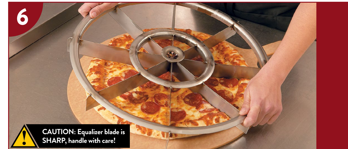
6 Slice pizza into 8–10 equal portions using an equalizer knife or pizza cutter.